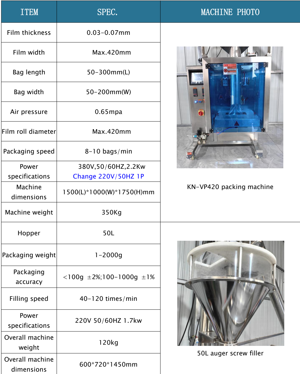
KN-VP420 packing machine